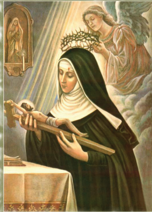
St. Rita of Cascia